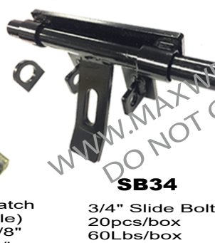
SB34 3/4" Slide Bolt 20pcs/box 60Lbs/box