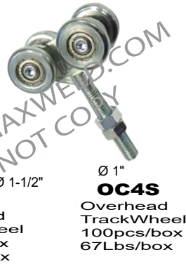
OC4S Ø 1" Overhead TrackWheel 100pcs/box 67Lbs/box