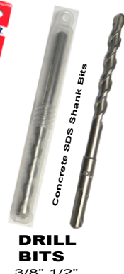
DRILL BITS 3/8", 1/2"