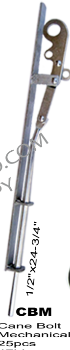
CBM Cane Bolt Mechanical 25pcs 47Lbs