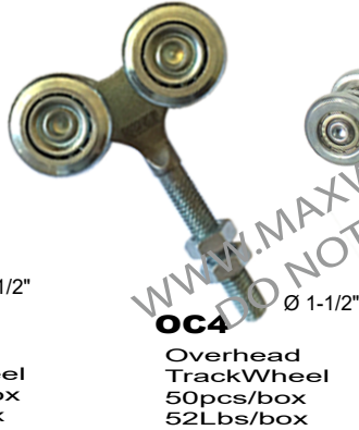
OC4 Ø 1-1/2" Overhead TrackWheel 50pcs/box 52Lbs/box