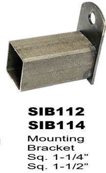
SIB112 SIB114 Mounting Bracket Sq. 1-1/4" Sq. 1-1/2"