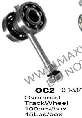
OC2 Ø 1-5/8" Overhead TrackWheel 100pcs/box 45Lbs/box