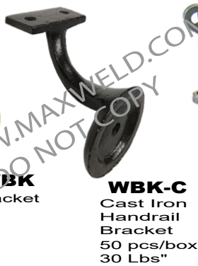
WBK-C Cast Iron Handrail Bracket 50 pcs/box 30 Lbs"