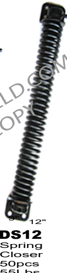
DS12 12" Spring Closer 50pcs 55Lbs