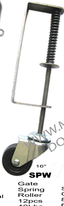
SPW 16" Gate Spring Roller 12pcs 40Lbs