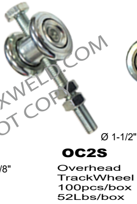
OC2S Ø 1-1/2" Overhead TrackWheel 100pcs/box 52Lbs/box