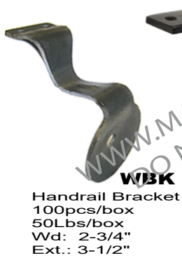
WBK Handrail Bracket 100pcs/box 50Lbs/box Wd: 2-3/4" Ext.: 3-1/2"