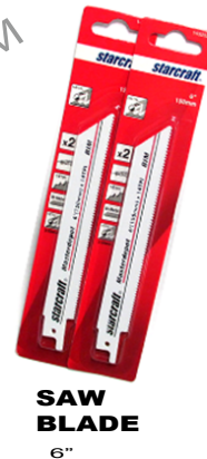
SAW BLADE 6"