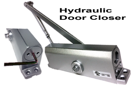
Hydraulic Door Closer